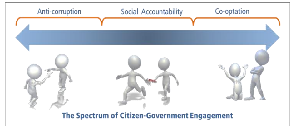
Figure 1. The Spectrum of Citizen-Government Engagement (Briones, 2014)

Citizen Participatory Audit (CPA) is guided by the principles of Social Accountability, defined as the “constructive engagement between citizens and government in monitoring government’s use of public resources to improve service delivery, protect rights, and promote community welfare” CPA does not adopt anti-corruption where citizens take on the role as watchdogs, sometimes associated with “finger-pointing” and “blaming-the-other”; nor co-optation as a strategy to silence the opposition.