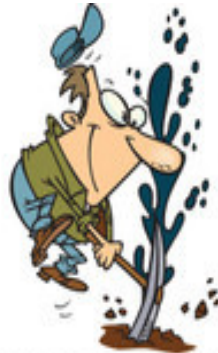
Image: 438074 illustrations Of.com