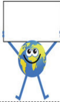
Image: 66339 illustrations Of.com